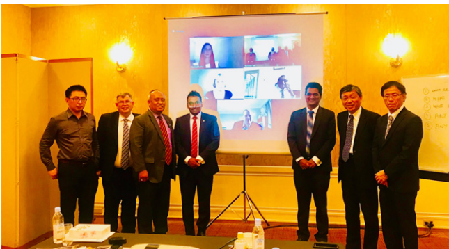
After SEARCC ExCo Meeting with in-Person and Virtually Participating Member Countries