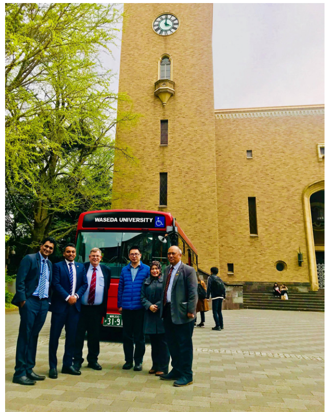
At Waseda University in Japan, visiting Academia and Research Sectors